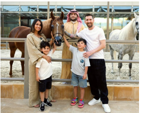
Pune (Voice news service):- Saudi's national tourism brand 'Saudi Welcome To Arabia' has kicked off another global marketing campaign featuring football legend and Saudi Tourism Ambassador, Lionel Messi.

Launching across key target markets in Europe, India and China, the "Go Beyond What You Think" campaign is anchored on consumer insights, which revealed there are still common misconceptions about the destination, and invites audiences to experience the incredible and vibrant cultural transformation taking place across Saudi. Those that know Saudi are encouraged to share positive experiences and memories on TikTok and social channels using the bi-lingual hashtags #ShareYourSaudi and in Arabic #سأوريحب. The latest 'Saudi Welcome to Arabia' brand campaign is a combination of TV, Social, Digital, and OTA tactics activated over a three-month period. It is the latest in a series of initiatives by Saudi Tourism to foster broadening